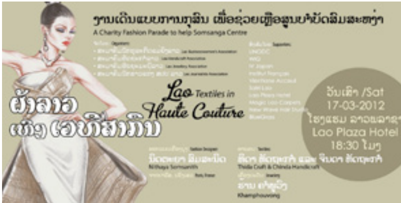
Figure 3: Invitation to a fundraiser for the Somsanga drug detention centre, co-sponsored by UNODC, March 2012

The centres are typically run by public security or military officials rather than public health practitioners, and usually lack qualified medical personnel or evidence-based treatment for HIV or other common illnesses.