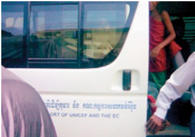
Figure 4: Photo reported as showing children being transported to an abusive ‘rehabilitation’ centre in a UNICEF/EU vehicle, a claim denied by Unicef 103

of the day is filled with agricultural labor, physical exercise, watching television, and free time. 99